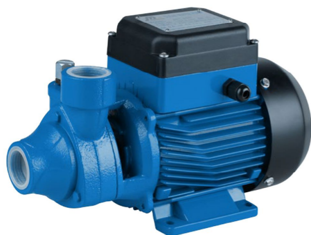
PM Series Peripheral pump