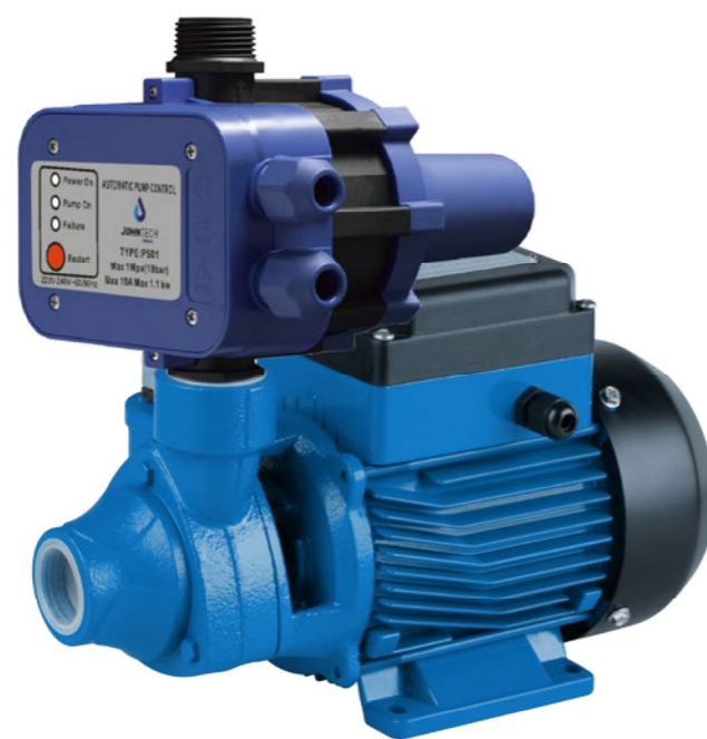
JET-JM Series pump with PS-01 controller Available for: PM-45 PM-80