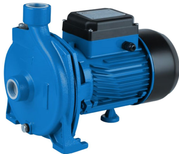
CPM Series pump