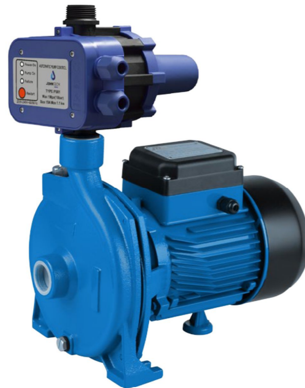
CPM Series pump with PS-01 controller